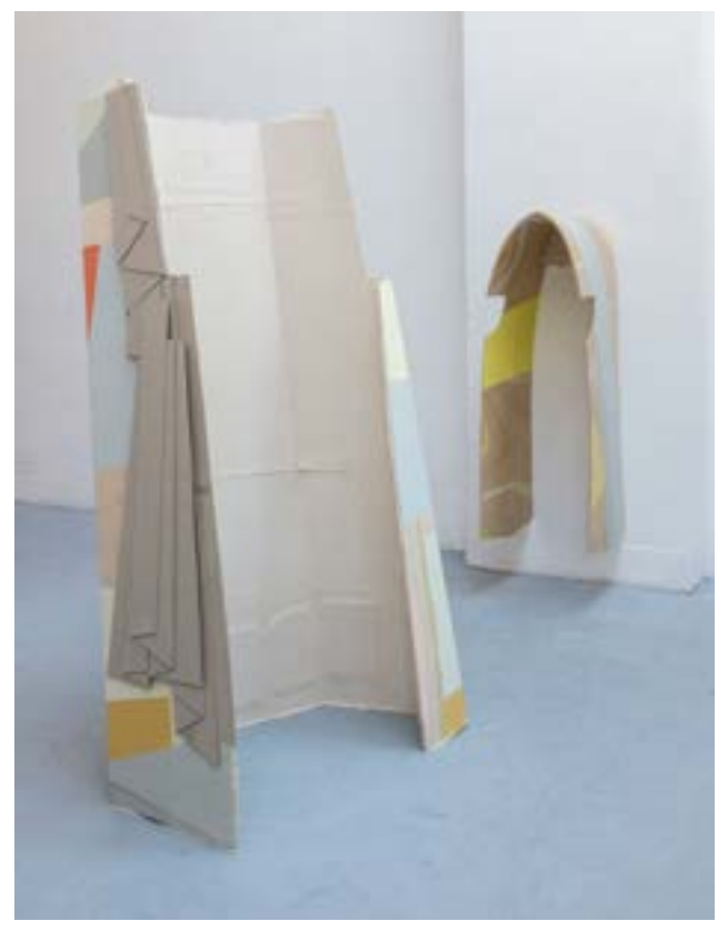
Lynn Fulton's Studio, Spring Open Studios, March 2024