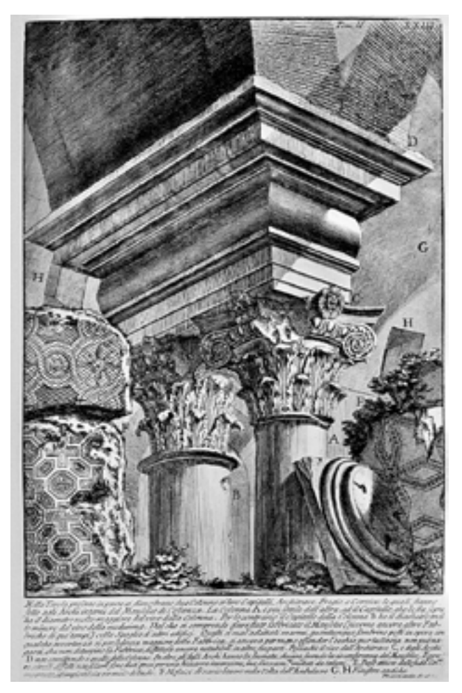
G.B. Piranesi, Interno dell'Mausoleo di Costanza, from Antichità Romane vol. II. BSR collection

Photographic exhibition by Antonio Palmieri. The exhibition will be open until 15 July, from Monday to Friday, 2 - 7 pm