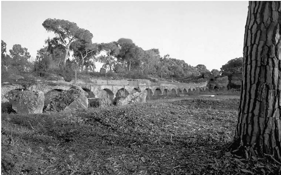
FIG. 5.24. The excavated façade of the Terrazza di Traiano in Area 8 from the northwest.

with the rear wall of structure 8.13. Visual inspection also suggests that 8.15 is very early in the archaeological sequence in this part of the site, although its function is unclear. It is possible that it is to be