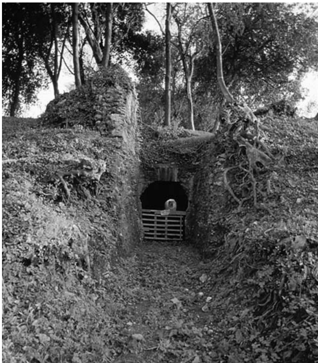
FIG. 5.25. The entrance to the cryptoporticus parallel with the Terrazza di Traiano beneath the Palazzo Imperiale in Area 8, showing the height of the surviving structures. View from the north.

identified with the structure Lanciani (1868) described as a theatre, although his plan shows this further to the southwest and it is difficult to reconcile with his description.