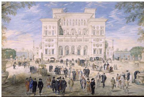
View of the Villa Borghese, Johan Wilhelm Baur, 1836.