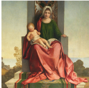
Giorgione, Madonna and Child (detail from the Castelfranco Altarpiece ), Duomo di Santa Maria Assunta e San Liberale, Castelfranco Veneto.