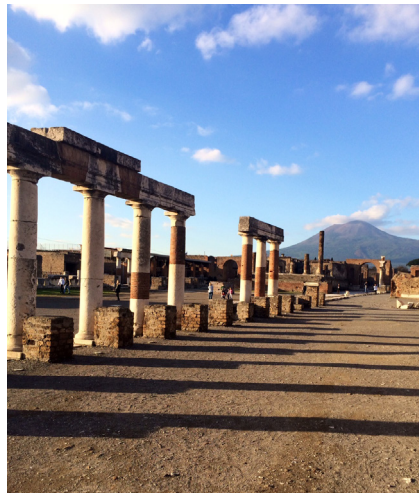
The Forum at Pompeii, ('Il Grande Progetto Pompei: lavori in corso e prospettive', Massimo Osanna)