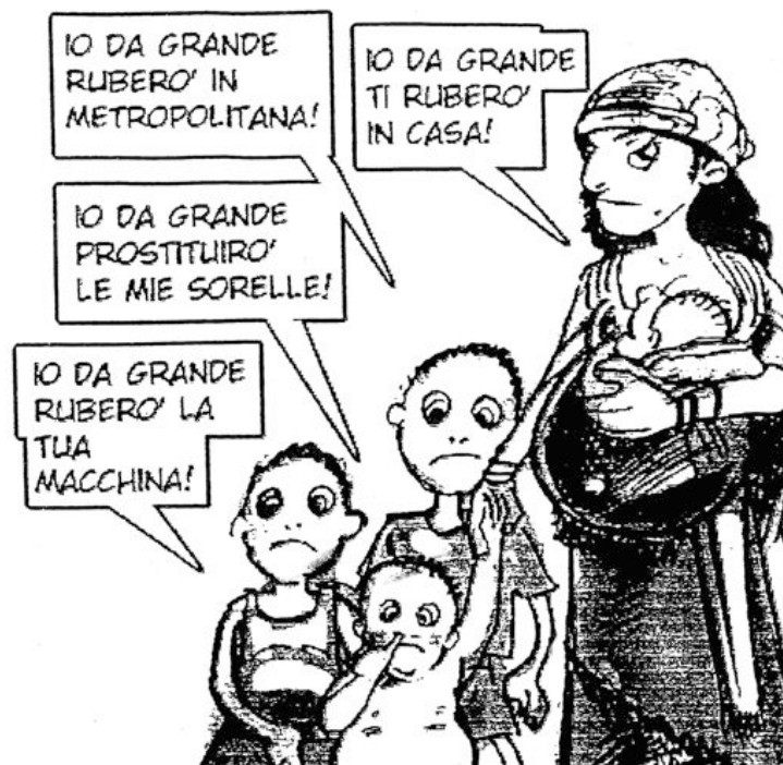
Detail of leaflet circulated by Azione Universitaria, Rome, October 2007

An International Conference and Exhibition British School at Rome